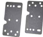
FIFTH WHEEL SHIM PLATES