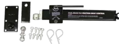
PACKAGE GH-601 SHOWN